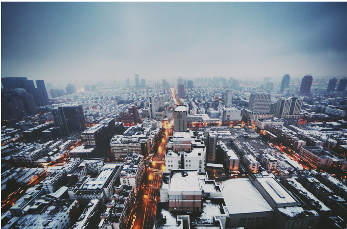
Cities are often on the frontline of today's challenges, including climate change and socioeconomic inequalities.

The Summit of the Future could recognize this central role played by local and regional governments and make specific commitments around partnering and supporting them going forward. 22