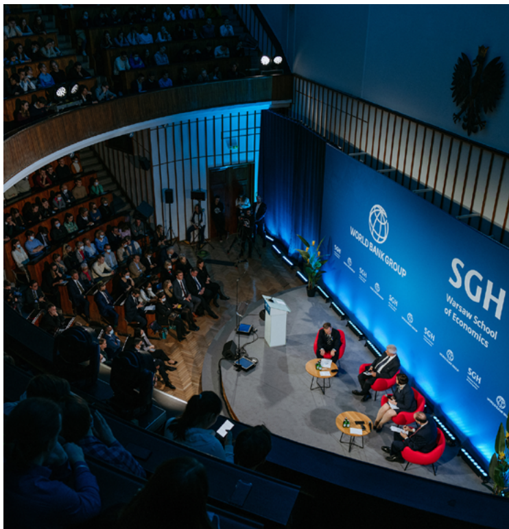
Photo: Jacek Waszkiewicz / World Bank Group. “The World Bank’s global mandate and reach make it an ideal platform to address today’s cross-border challenges.”