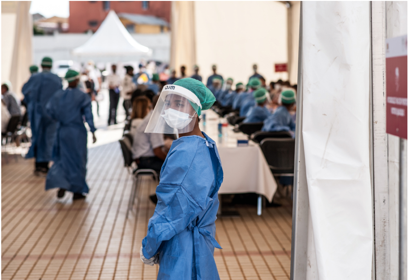
"The COVID-19 pandemic made abundantly clear that health security is fundamental to global stability."