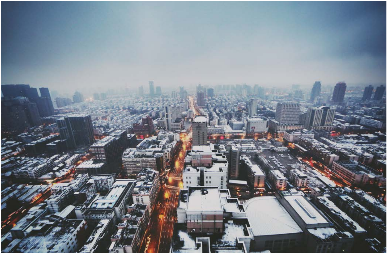
Cities are often on the frontline of today's challenges, including climate change and socioeconomic inequalities.

The Summit of the Future could recognize this central role played by local and regional governments and make specific commitments around partnering and supporting them going forward. 22